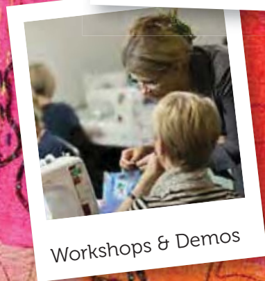
Workshops & Demos